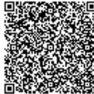
Overseas Department Calendar