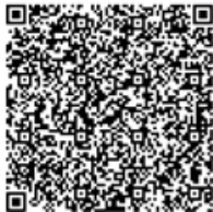
Church HQ Calendar

As the amount of expected Besseki Lecture attendees is anticipated to greatly increase during these months before and after the 140th Anniversary of Oyasama, the days when live lectures are offered will be determined in advance. You may view this schedule by visiting the Church Headquarters homepage, as well as via the Overseas Department homepage. The QR Codes for both pages can be found below: